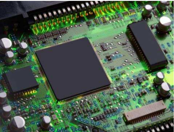
Cortec<sup>®</sup>'s powerful, vibration resistant, conformal coating enables continuous corrosion inhibition and protects printed circuit assemblies against contamination by providing a sealed micro-environment around the circuit board and its components.