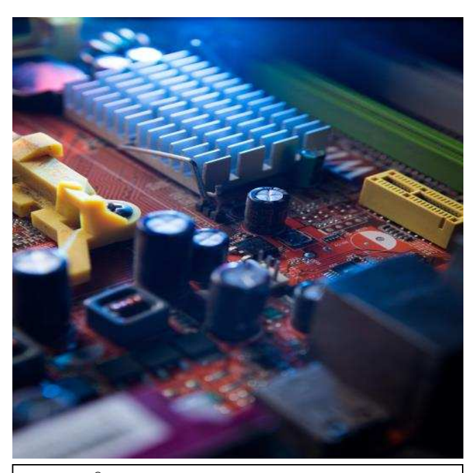
Ecosonic<sup>®</sup> Conformal Coating superiorly protects any environment that could damage the mechanics of a printed circuit board or substrate.

This high-tech nonconductive coating is designed to extend long-life performance of new and repaired electronic assemblies, especially those which are under adverse corrosion conditions such as high heat, chemicals, salt spray, moisture and atmospheric humidity. More importantly, it saves money by extending product life and reducing labor time.